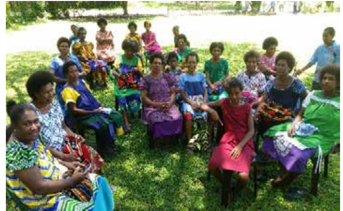
Co-operatives as an Organisational Model for Urban Women in Papua New Guinea (St Andrews University)